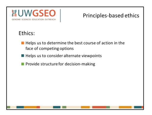
Slides 7 – 11 provide students with background on principles-based ethics.