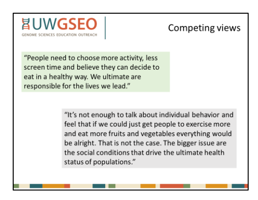
Slides 2 - 6

5. Ask students, "How do we make decisions about issues that affect all of us, when there are so many competing viewpoints?"